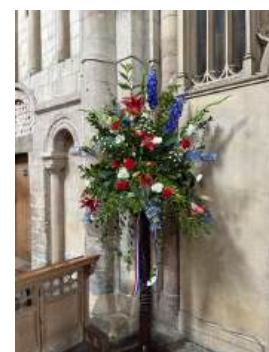
Arrangement in the colours of the Royal Norfolk Regiment