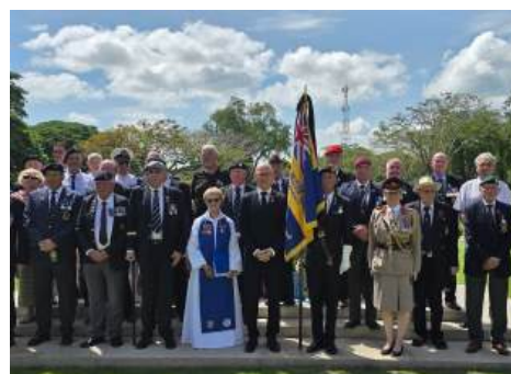
Chungkai Cemetery Thailand on 11 th November 2025